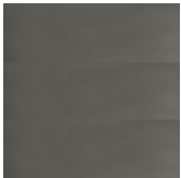
OPO transparent varnished